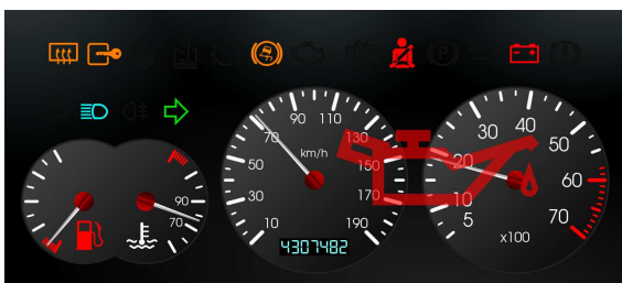
Figure 2: The car's instrument cluster model.

We tested the algorithm on a graphics interface representing the reconfigurable instrument cluster of a car: this includes lights, alert and warning indicators, odometer, speed, RPM, gas and temperature gauges. This model is a typical use case of safety-critical automotive user interface. This graphics interface is shown in figure 2. In this model, every indicator can be either “on” (coloured) or “off” (dark grey), furthermore, the red alert indicators can be scaled big and shown transparent over the speed/RPM gauges (as an emphasis for serious alerts). The odometer is made up of individual led bars (coloured of black) and any needle can rotate around its axis.