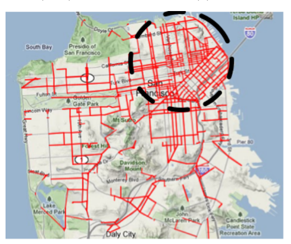
(e) Mid Day Congestion (MDC)

Figure 3: Typical spatial configurations of traffic states for each of the five clusters. On each figure, we display the links with fluid index values less than 0.7 (congested links). Most of the congestion occurs within the region highlighted by the dashed circle, which is the downtown region of San Francisco. The NFF and EFF clusters have a smaller number of links highlighted than the MIC, ADC and MDC clusters indicating the difference in congestion levels. 13