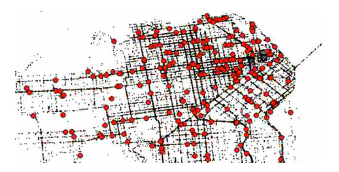
Figure 1: San Francisco taxi measurement locations, observed at a rate of once per minute. Each small dot represents the measurement of the location of a taxi, received between midnight and 7:00am, on March 29th, 2010. The large dots represent the location of taxis visible in the system at 7:00am on that day.

analysis (Autoregressive Moving Average) on traffic flows in order to forecast traffic states. Very 51 little progress has been made in analyzing the temporal dynamics of qlobal traffic states of an 52 entire large-scale road network. We call global traffic state, the aggregation of the congestion 53 states of all the link of the network. Traffic states of neighboring individual roads are often highly 54 correlated (both spatially and temporally) and the identification of specific traffic patterns 55 or traffic configurations is very informative. They can be used to better understand global 56 network-level traffic dynamics and serve as prior knowledge or constraints for the design of traffic 57 estimation and prediction platforms. The analysis of traffic patterns is also useful for traffic 58 management centers and public entities to plan infrastructure developments and to improve the 59 performances of the available network using large-scale control strategies. 60