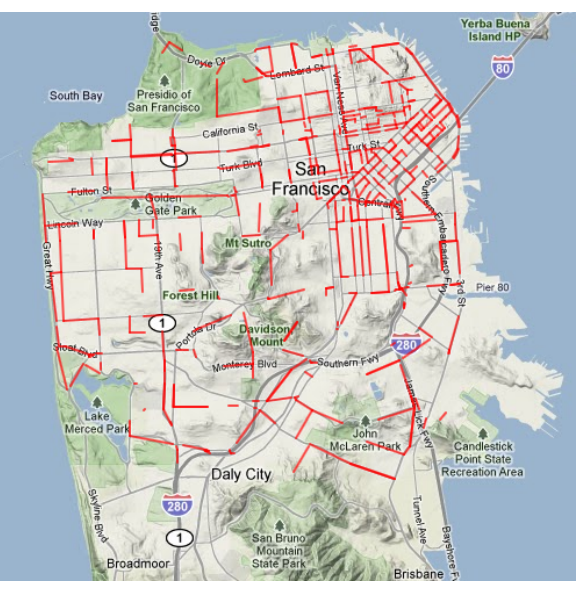
(b) "Central" NMF component