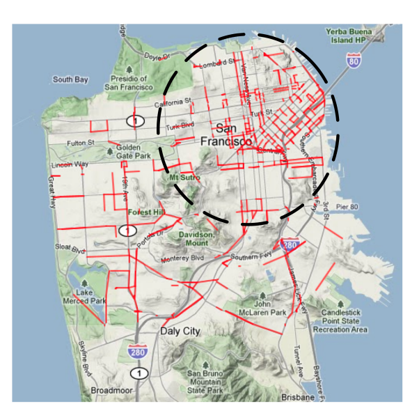
(d) "North-South transit" NMF component

Figure 4: Examples of interesting NMF components, either highlighting localized behavior (a and b), or flow-direction correlations (c and d).