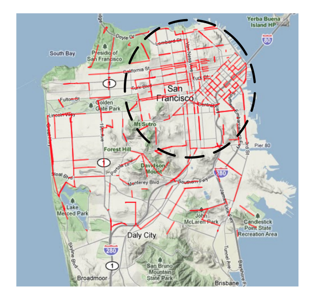
(c) "East-West transit" NMF component