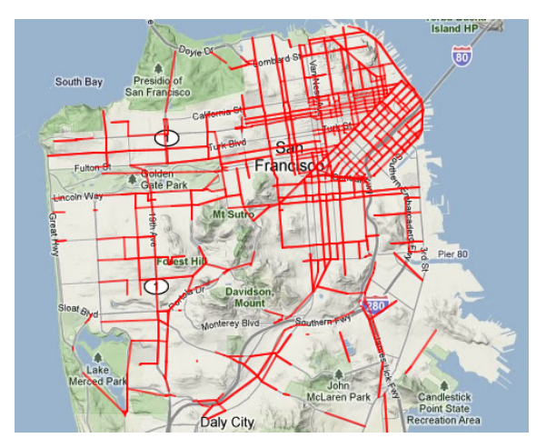
(d) Afternoon Decreasing Congestion (ADC)