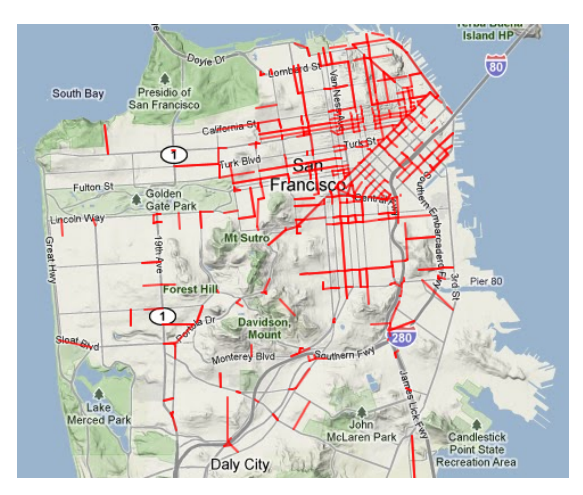
(a) Night Free-Flow (NFF)