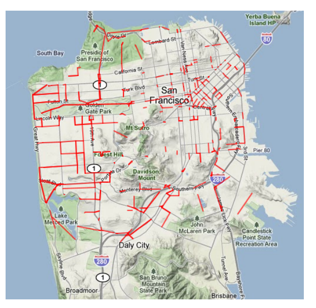
(a) "West Part" NMF component