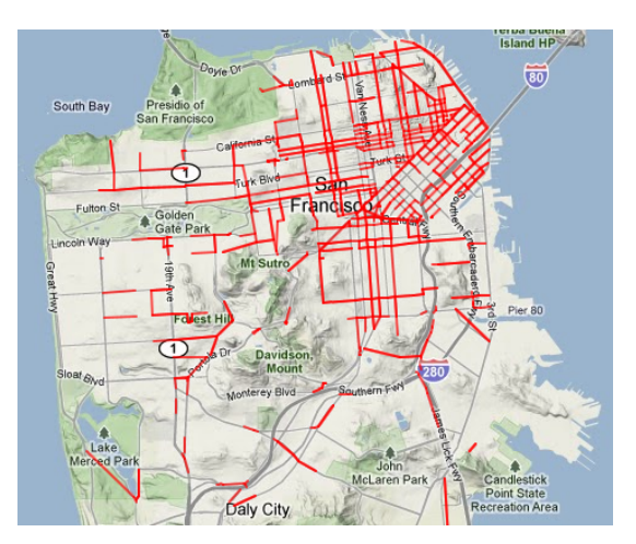
(b) Morning Increasing Congestion (MIC)