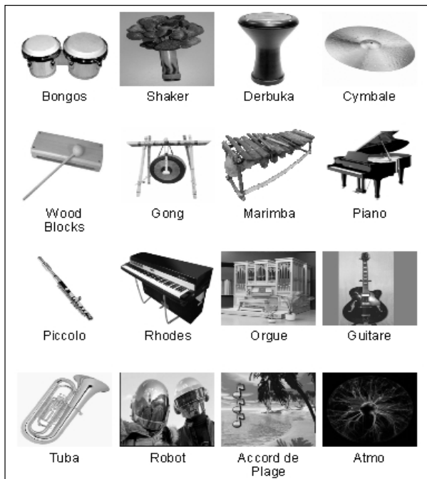
Figure 3. MIDI page of the instrument booklet

Unlike the first experiment, our system is given the exact same status as the usual instruments. This way we could see whether the children would still use the Wiimote system or revert to the standard instruments. Also, restricting the patients to only one instrument prevents them from being overwhelmed by the excitement induced by too large a choice.