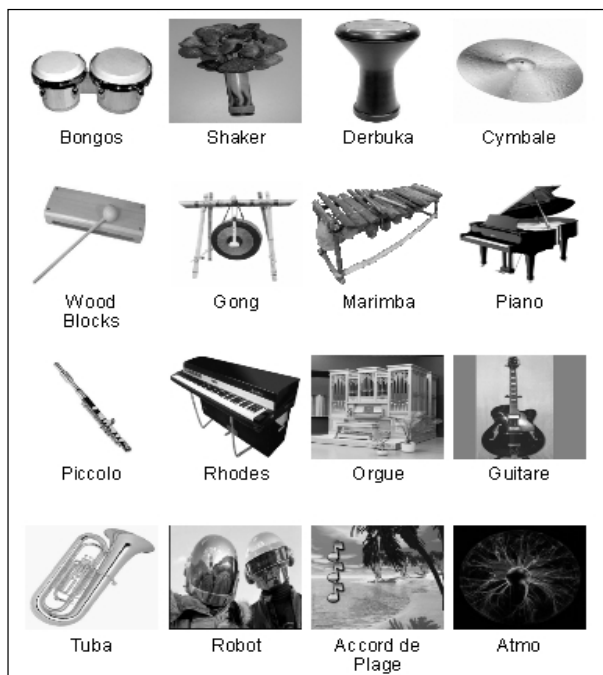
Figure 3. MIDI page of the instrument booklet

Unlike the first experiment, our system is given the exact same status as the usual instruments. This way we could see whether the children would still use the Wiimote system or revert to the standard instruments. Also, restricting the patients to only one instrument prevents them from being overwhelmed by the excitement induced by too large a choice.