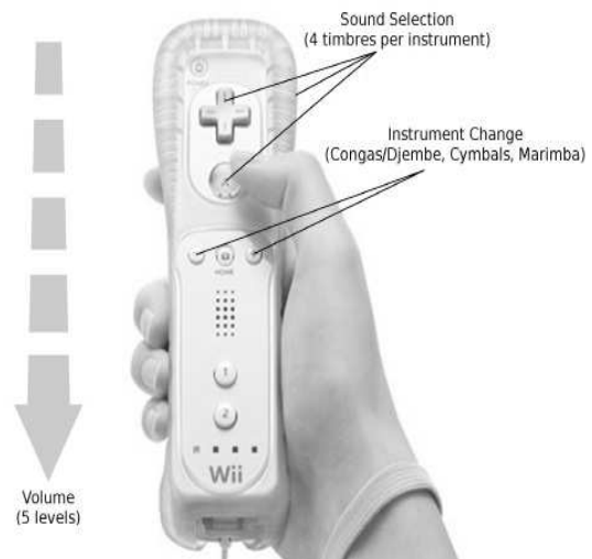
Figure 2. MAWii UI for sound generation (2 Wiimotes/patient)

Obviously, one of the great advantages of the Wiimote is that it can be used to control any synthesizable sound. Therefore, instead of having just one instrument each, we gave the children the possibility to have as many instruments as they would like.