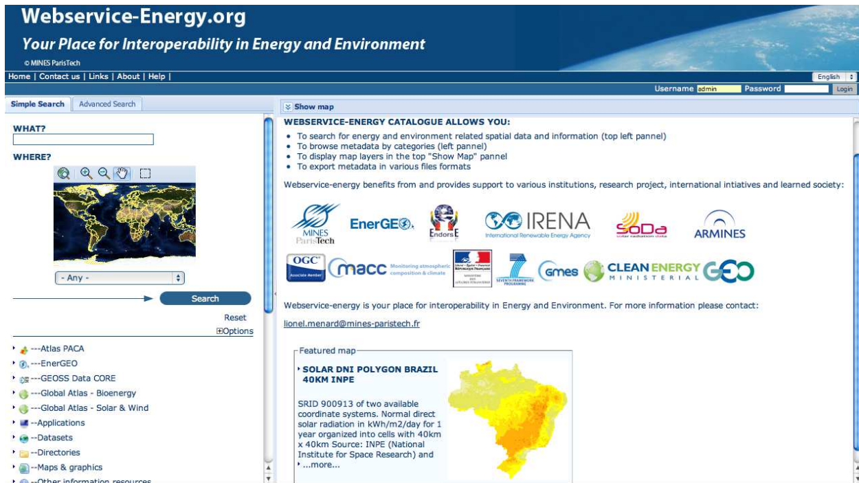
Figure 2 - Catalog OGC CSW

Data: The data component includes all relevant datasets in solar and wind energy with local, regional and global coverage. Whenever it is possible those datasets remain in their original location but the framework has also the possibility to host data from partners that do not have their own infrastructure.