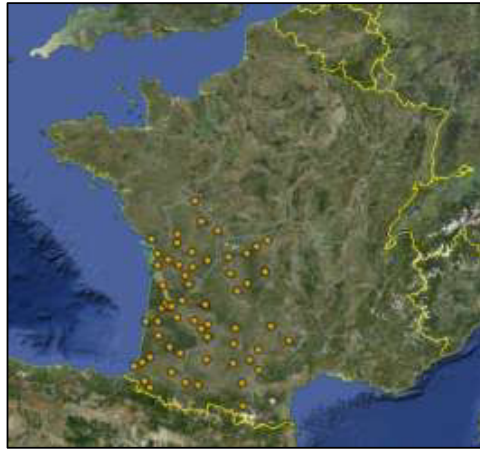
Fig. 1. Location of the 61 ground stations measuring GHI in the South-West quarter of France.

Météo France is the French meteorological network which consists in 3,811 meteorological ground stations located in the country, among which only 327 used to or still measuring GHI. It is also to be noted that only 7 of them measured in the past the direct component of the SSI and, presently, only one is still measuring it. The analysis presented below focuses on the South-West quarter of the country (130,132km 2 , 20% of the territory) whose irradiance level is suitable to PV project and where 61 ground stations measure this component ( cf. Fig 1).