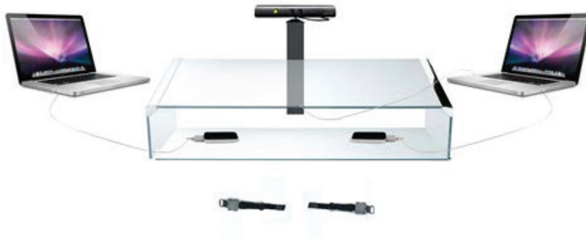
Fig. 2. Intangible musical instrument.

The first activity includes some introductory description about the technology and the sensors to the learners. At the end of this activity learners will get familiarized with the main functionalities of the platform, which will be used during the next activities. The second activity presents the theory of music and has two levels, elementary and intermediate level. The elementary level (Fig. 1) refers to beginners and presents to learners a basic theory of music, such as notes, duration, intervals, scales, etc. The intermediate level is for advanced learners, and presents triplets, ornaments, dynamics, chords, etc. At the end of these activities, the learner will get familiar and know the theory of music that s/he has attended. The educational material in all activities include slides with texts, audio resources, videos as well as some exercises/quizzes in the end of each lesson.