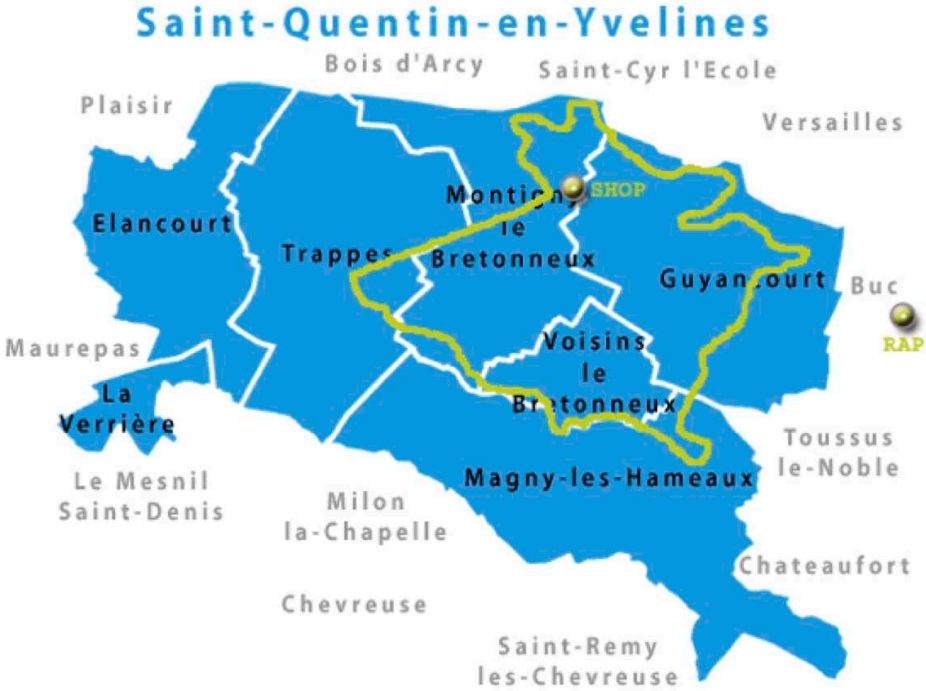
Figure 2: Twizy Way service area (marked by a green line).

By dividing responsibilities as such, Renault contributed to an urban planning policy dedicated to developing the infrastructure for electric car sharing (terminals and stations). However, during the negotiation process, Renault decided to reduce the perimeter of experimentation. The Saint-Quentin's officials refused to spend public money on the installation of charging terminals and closed stations on the public space.