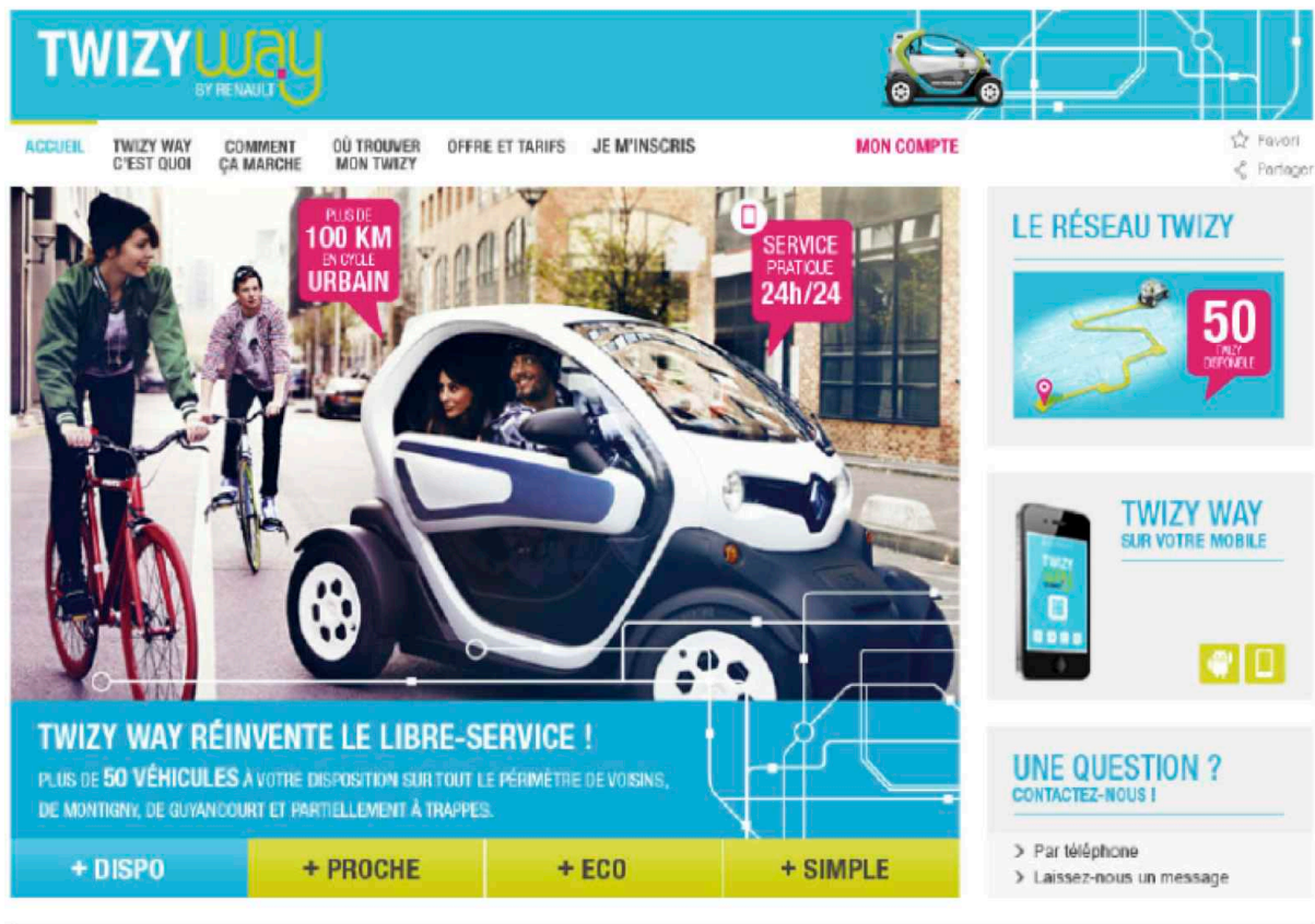
Figure 1 : Twizy Way website

Four components define the perimeter of the experiment. They are: a) the geographical site, b) the distribution of the charging terminals, c) the setting up of fixed stations and d) the type of vehicle available for car sharing. These closely connected elements configure the sociotechnical architecture of the experiment: they define the scenery of the sites (distinguishing features of the towns), the organisation outline of the service (distribution of cars and stations) and the suitable technologies (type and features of the vehicle). In other words, those components define the different types of boundaries of the experiment: urban boundaries (why choose this town over another), organisational boundaries (why choose terminals and closed stations over opened ones) and technological boundaries (why choose this particular kind of vehicle over another). This paper will now successively examine each of those four components and illustrate their redefinitions over the course of the project.