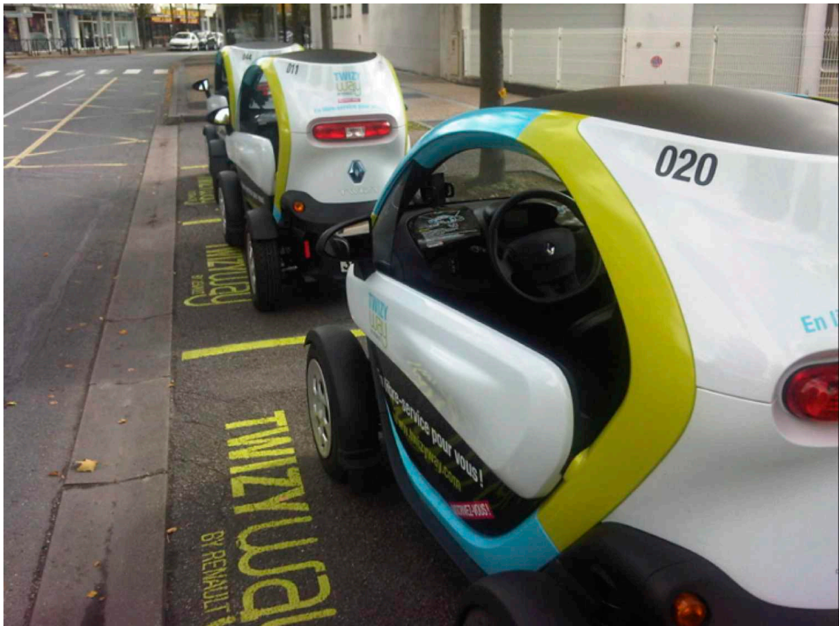
Figure 4: Twizy vehicle

For Renault, the Twizy model seemed to be a real opportunity to explore the realm of car sharing with a 60 to 80 km range and a 3.30 hour full charging time. Yet, the manufacturer was well aware that, in order to get in on the electric car sharing market, it would have to produce the technical equipment required for the service. Although the company's force lay not in the size of the service area, the technological aspect could definitely make a drastic difference regarding car fleet management. Adapting the Twizy car to a sharing system