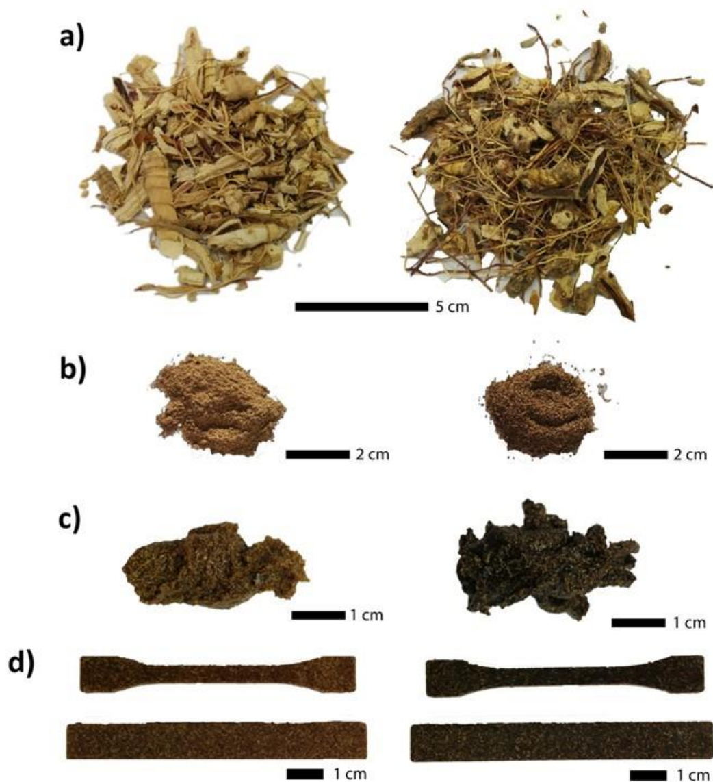
Figure 1. Physical aspect of GIG (left) and GOL (right) belowground materials a) before grinding, b) after sieving (fraction collected with 200-300 \mu\text{m} openings), c) after mixing in the internal mixer, and d) after injection molding.